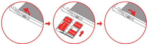
Figure 2: WLAN + LTE