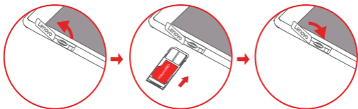
Figure 1: WLAN